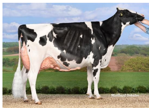
Fux Seattle 6/EX 96 (Sire: Gold Chip) Highest excellent cow in Germany