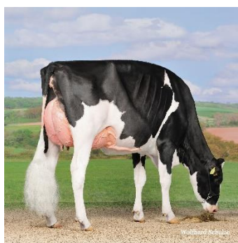
Loh Tj Alessja 3/EX 92 (Sire: Armani) Black and White German Champion and 2019