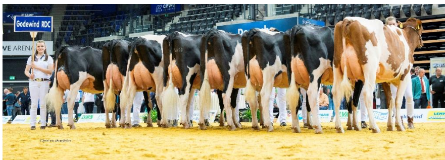
The daughters of the popular sire Godewind RDC (Gold Chip x Sanchez x Goldwyn) during the German Dairy Show in 2019.