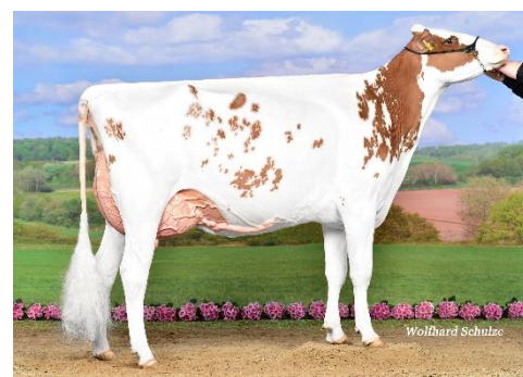
FG Natalie 3/EX 92 (Sire: Mad Max) Red and White German Champion 2019

German Livestock Association (BRS) • Adenauerallee 174 • D-53113 Bonn